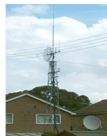
Amateur radio operator's equipment