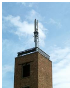
Mast on existing structure