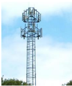
Mast with more than one operator

Lattice structures covered with antennas and dishes are not aesthetically pleasing, and are the most visually intrusive. As far as microwave radiation is concerned, low height high-power masts are responsible for higher levels of RF exposure to the general population than the ugly, but high ones. Slim monopole masts usually blend in better, looking not too unlike high lampposts, but these structures can't easily be shared.