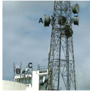
Drums, Large (A), Medium (B), Small (C)

Dishes, or drums, have very focused beams and are used only for communication between one base station and another. There is negligible radiation from these, though some people are sensitive even to these low levels.