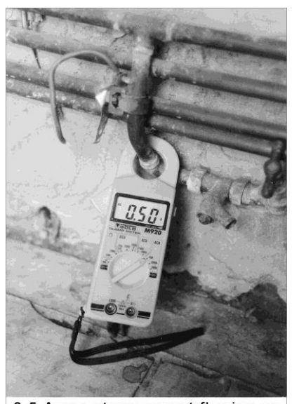
0.5 Amps stray current flowing on incoming main cold water pipe

We use three-phase plus neutral. If all three phases are balanced then there is zero current flowing in the neutral. However, houses are wired to the supply in phase sequence and some phases end up more highly loaded than others. The imbalance current flows along the neutral. If the neutral isn't there, then you can get 40 volts on one phase and 330 volts on another and blow up all the bulbs and electronics in affected properties. By earthing the neutral every 100 metres there are always reasonable return paths available to the houses with a broken neutral in their feed so all three phases usually keep within the regulations (216.5 to 253 volts).